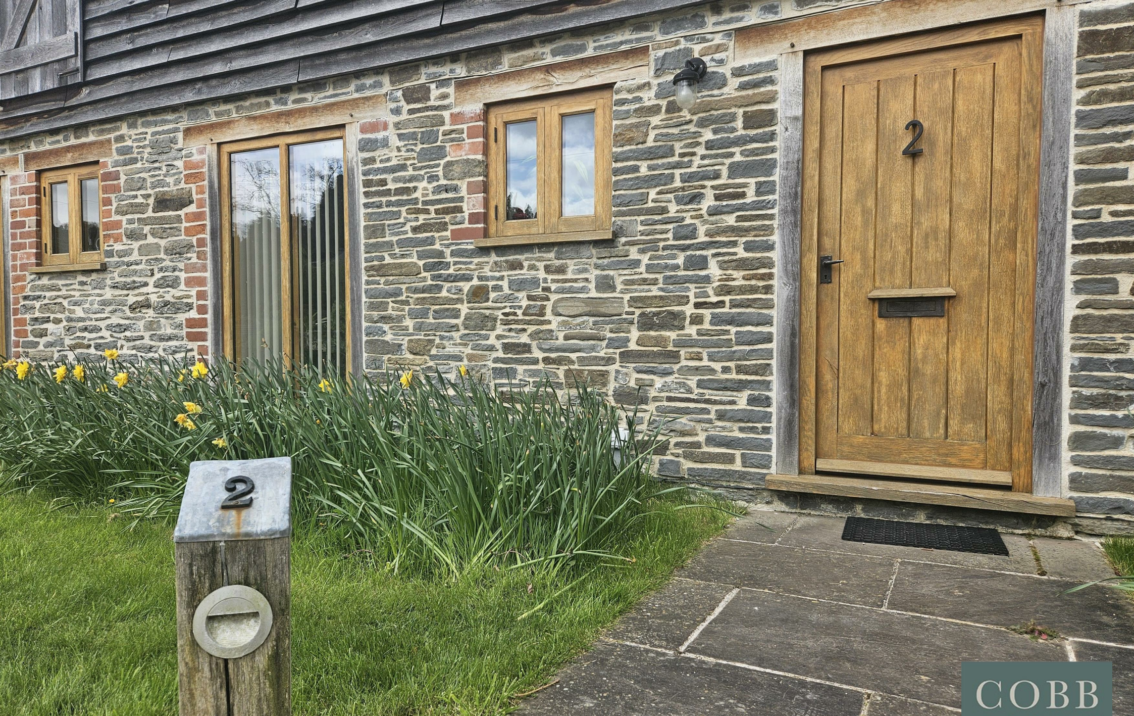
2, Court House Barns, Presteigne, LD8 2NT Offers Over £350,000